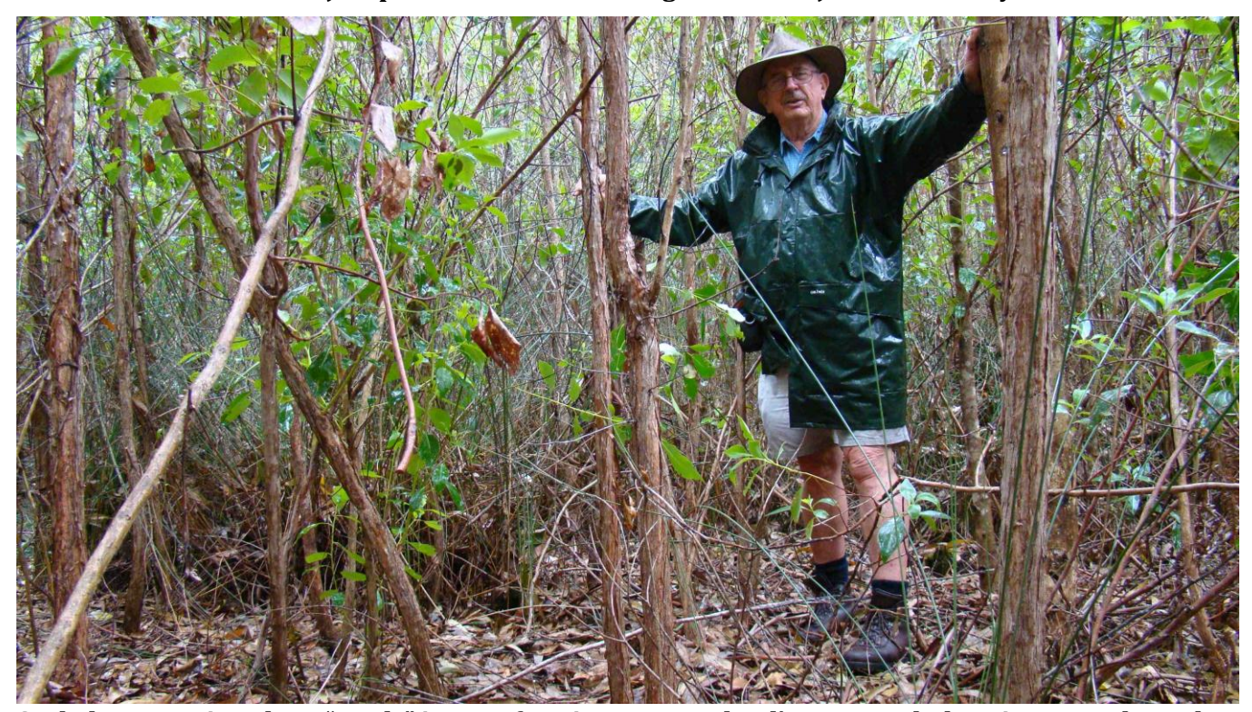
Such down-cutting along "roads" is transforming Fraser Island's geomorphology in many places, but none more seriously than where that sediment is filling lakes. So much road sediment has flowed into Yidney Lake that a forest of Eucalypts now grows in what used to be a permanent water body. The Australian Government bears some responsibility for allowing the death of one of Fraser Island's outstanding universal World Heritage values